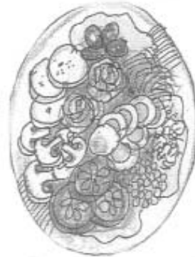
MUSHROOM & ARTICHOKE